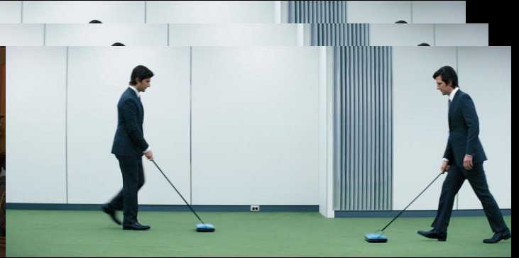
neuroticism in action