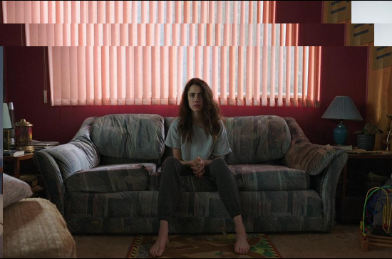
clean wide master