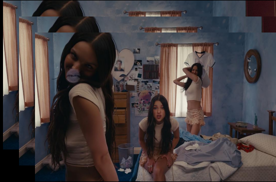
duplicates, refractions of oneself

an overt visualization of the overthinking, big-hearted, brown boy